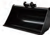
Toothless Shovel Bucket