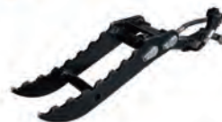
Hydraulic thumb clamp