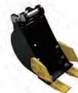
20cm Toothed Shovel